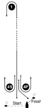
WINDWARD - LEEWARD